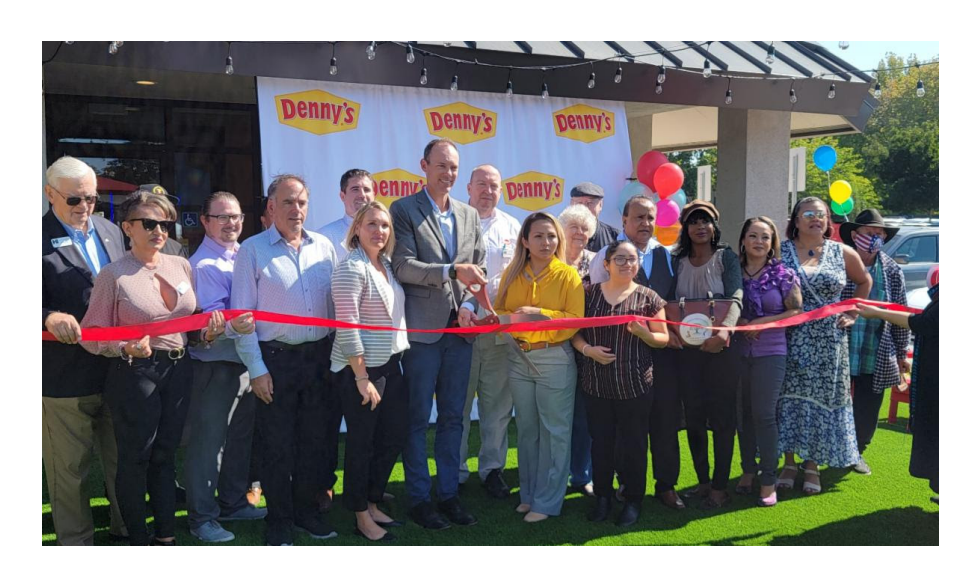
Congratulations to Denny's on their grand opening and ribbon cutting in Hayward. Denny's is a diner-style, chain restaurant located on Hesperian Blvd.