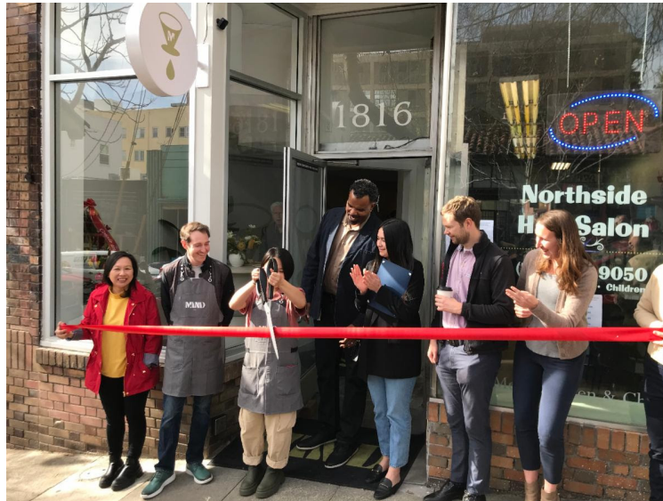
Photo from Mind Coffee's grand opening and ribbon cutting in the City of Berkeley. Thank you to the Chamber of Commerce and Mind Coffee for putting together such a wonderful grand opening event.