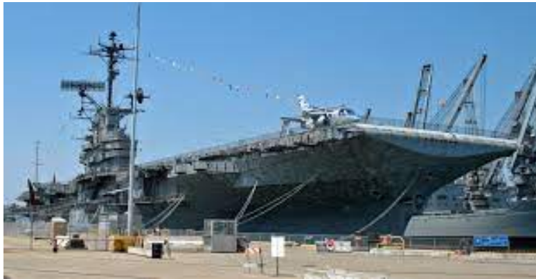
Photo of the USS Hornet in Alameda

The Alameda Chamber of Commerce has been around for more than 90 years. The Chamber renamed itself to the Alameda Chamber & Economic Alliance, focusing their mission on supporting the economic growth of the City and dedicating the Chamber as an innovative resource for all businesses in the City of Alameda.