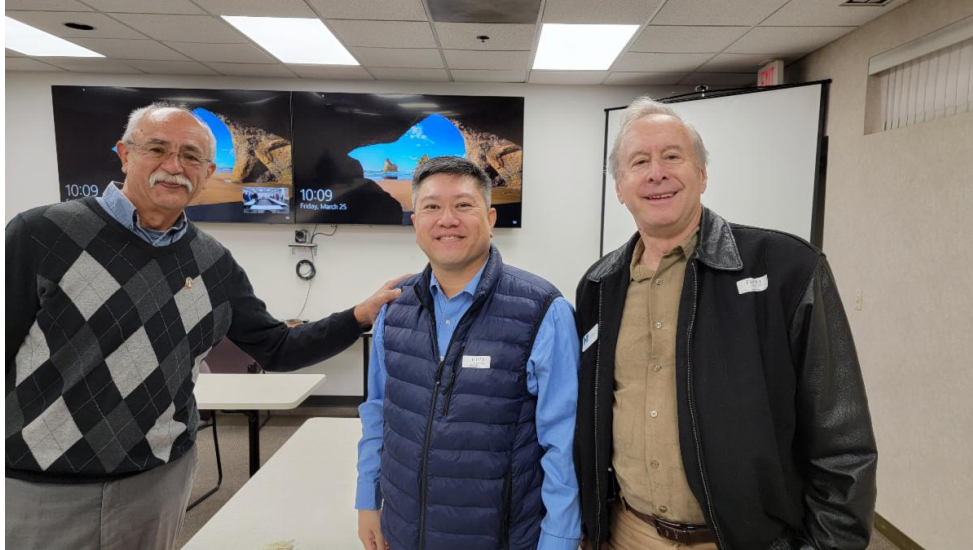
Photo from the Hayward Chamber of Commerce Latino Business Roundtable event.