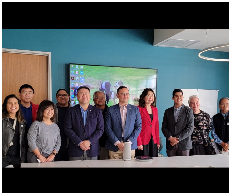
Photo from the first hybrid in-person/ Zoom Asian American Pacific Islander Roundtable meeting.