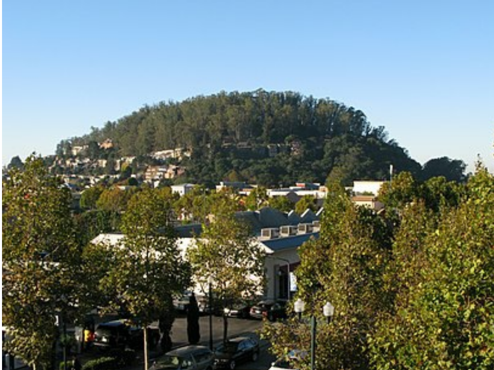
Photo of the historical Albany Hill in Albany, CA.