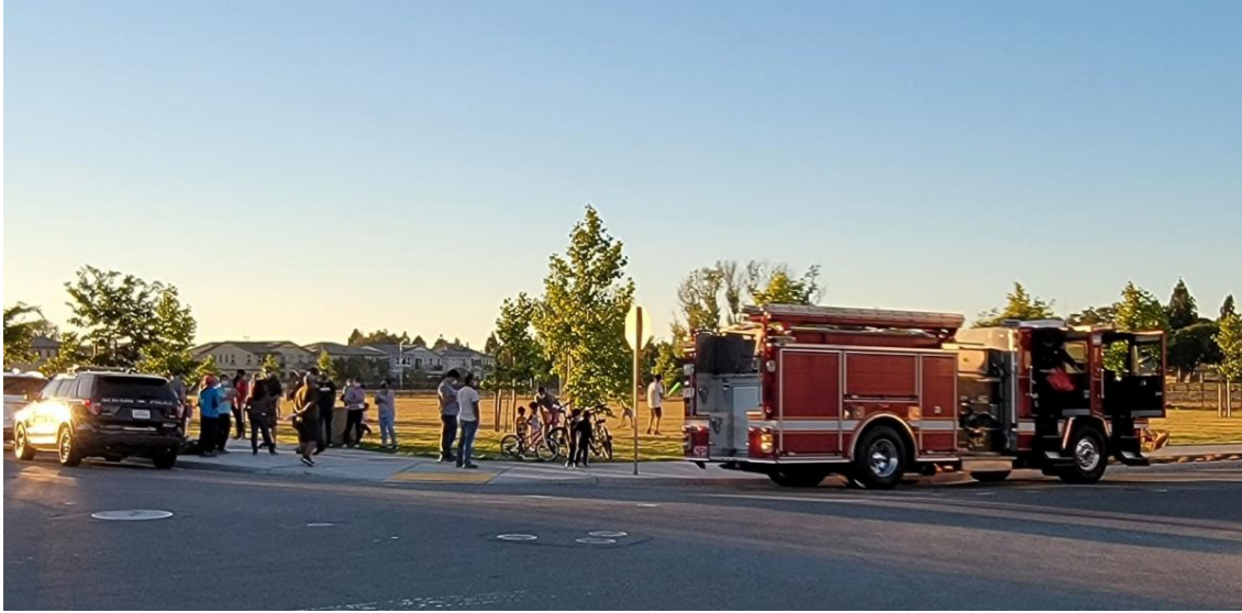
Photos of National Night Out events throughout Alameda County, including Alameda, Newark, and Oakland.