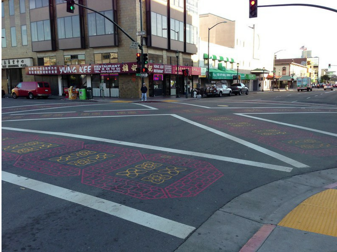
Photo of a Painted Crosswalk in Oakland Chinatown

Oakland's Chinatown was settled in the 1850s and is one of the oldest Chinatowns in the United States. The Chinese were some of the first Asian groups to travel to California to help build the Central Pacific Railroad. While many Chinese migrants first settled near the Oakland Estuary at First Street and Castro, after 1882, the Chinese Exclusion Act and exclusive local law forced them to resettle at the current location, which is now known as Oakland Chinatown. In 1906, the San Francisco earthquake and fire damaged San Francisco Chinatown, causing thousands of Chinese to move across the Bay to Oakland.